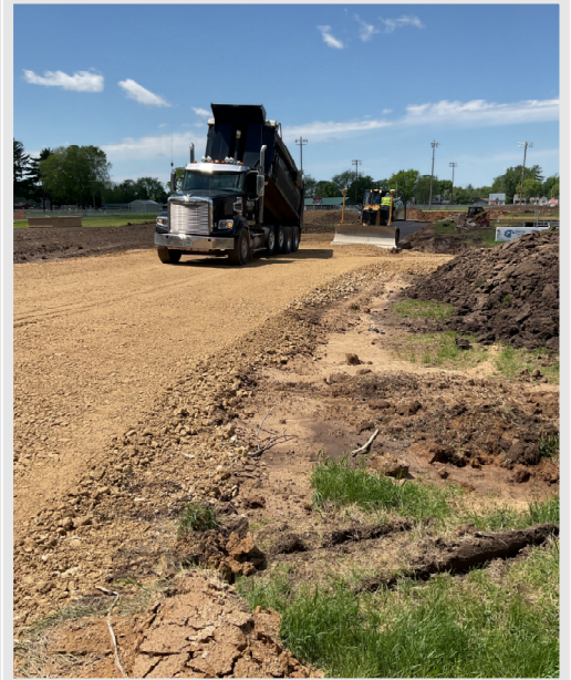
Building a Temporary Construction Road Start to Finish