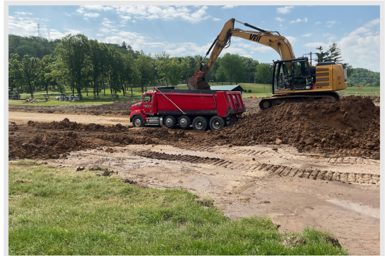
Local Trucking Company - Frey Trucking hauling material