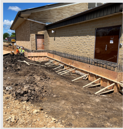
First Footing Pour is Formed