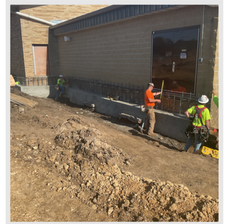
First Footing Pour is Complete!