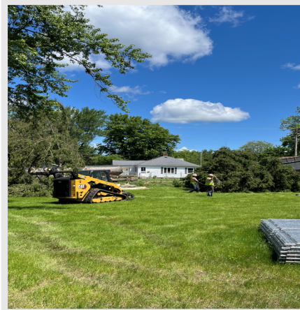
Tree Demo for Retention Pond and Parking Lot Expansion